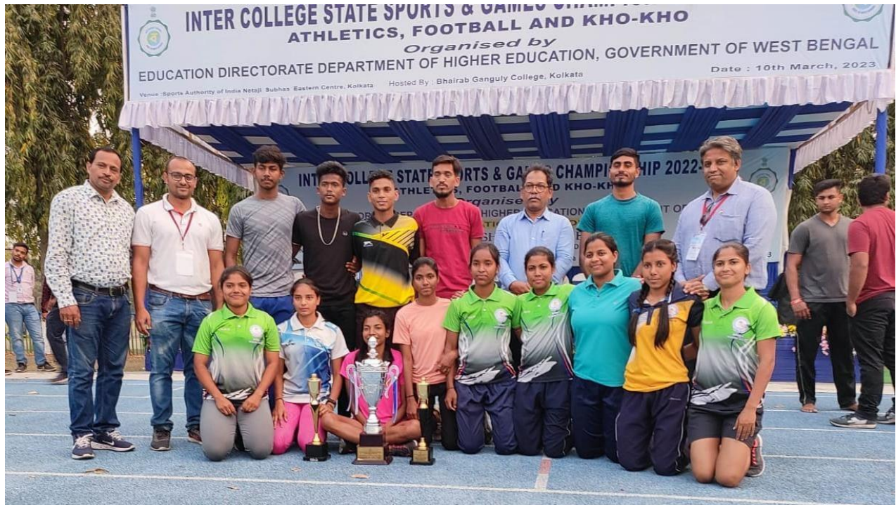
Photo-4: Proud Moment for State Institute of Physical Education for Women, Hastings House, Kolkata represented the District of South Kolkata, become the Champion District of the State Athletic Championship-2023 with 8 women athletes from this college